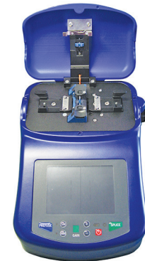
ZEUS D50 Fusion Splicer