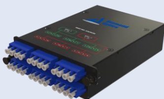
Modular up to 36 port LC cassettes